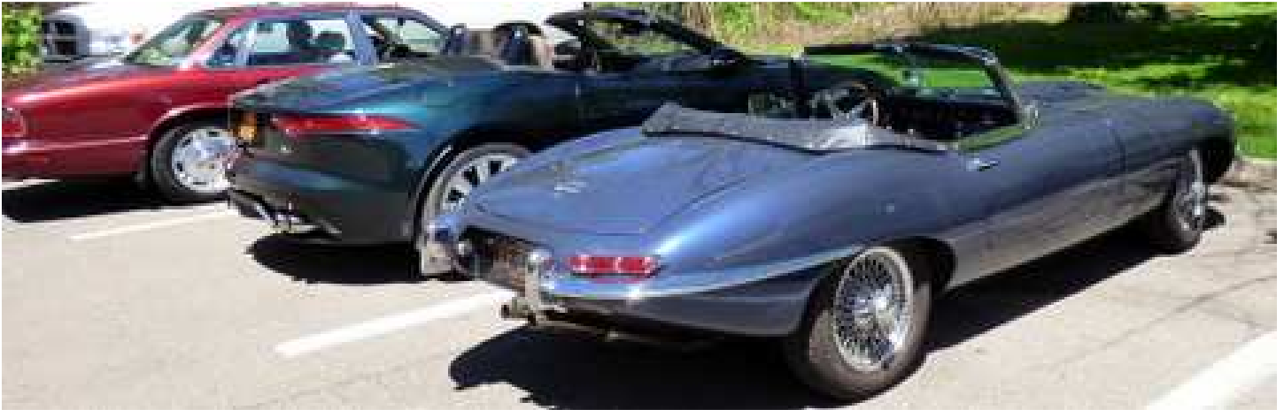
A sampling of the Jaguar Club cars.