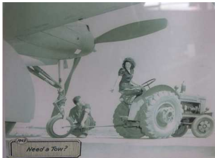
One of many historic posters at the Niagara Aerospace Museum.